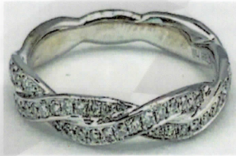
IMAGE NOT ACTUAL SIZE & HAS BEEN ENHANCED FOR VISUAL EFFECTS.

Retail Replacement Estimate $ 2,800.00 USD $ 0.6749 Aud Gold $ 3,512.22