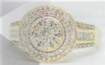
IMAGE NOT ACTUAL SIZE & HAS BEEN ENHANCED FOR VISUAL EFFECTS