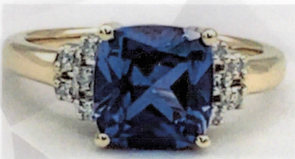
IMAGE NOT ACTUAL SIZE & HAS BEEN ENHANCED FOR VISUAL EFFECTS.

Retail Replacement Estimate $ 1,350.00 USD $ 0.6649 Aud Gold $ 3,550.56