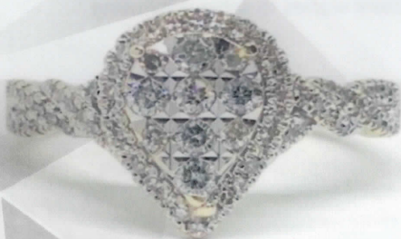
IMAGE NOT ACTUAL SIZE & HAS BEEN ENHANCED FOR VISUAL EFFECTS