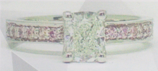
IMAGE NOT ACTUAL SIZE & HAS BEEN ENHANCED FOR VISUAL EFFECTS

Retail Replacement Estimate $ 18,750.00 USD $ 0.6674 Aud Gold $ 3,103.19