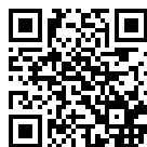
Image purported by client on report.

Diamonds with excellent light performance return maximum of the light entering them, and to an observer these diamonds look more brilliant and beautiful compared to others. The perfect balance between brilliance, brightness, fire and optical symmetry contribute to bring out the life in a diamond.