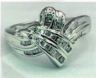
IMAGE NOT ACTUAL SIZE & HAS BEEN ENHANCED FOR VISUAL EFFECTS

Retail Replacement Estimate $ 1,600.00 USD $ 0.6532 Aud Gold $ 3,654.19