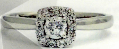
IMAGE NOT ACTUAL SIZE & HAS BEEN ENHANCED FOR VISUAL EFFECTS.

Retail Replacement Estimate $ 4,300.00 USD $ 0.6697 Aud Gold $ 3,040.71