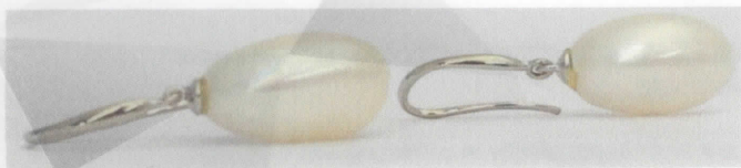
IMAGE NOT ACTUAL SIZE & HAS BEEN ENHANCED FOR VISUAL EFFECTS.

Retail Replacement Value $ 1,800.00 USD $ 0.6471 Aud Gold $ 3,006.85