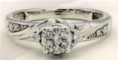
IMAGE NOT ACTUAL SIZE & HAS BEEN ENHANCED FOR VISUAL EFFECTS

Retail Replacement Estimate $ 1,760.00 USD $ 0.6649 Aud Gold $ 3,550.56