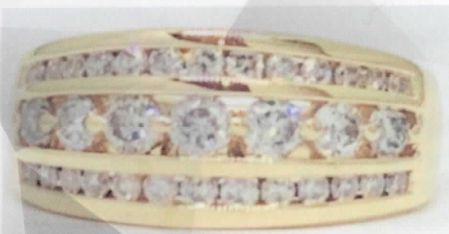
IMAGE NOT ACTUAL SIZE & HAS BEEN ENHANCED FOR VISUAL EFFECTS