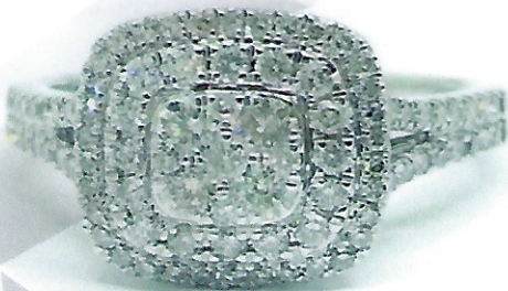
IMAGE NOT ACTUAL SIZE & HAS BEEN ENHANCED FOR VISUAL EFFECTS

Retail Replacement Estimate $ 4,470.00 USD $ 0.6690 Aud Gold $ 2,646.74