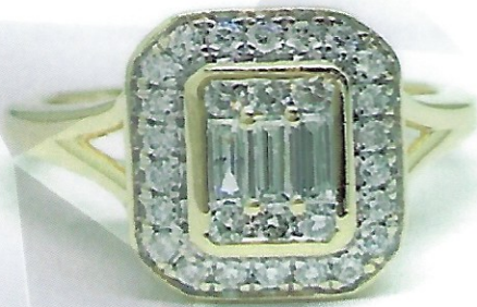
IMAGE NOT ACTUAL SIZE & HAS BEEN ENHANCED FOR VISUAL EFFECTS