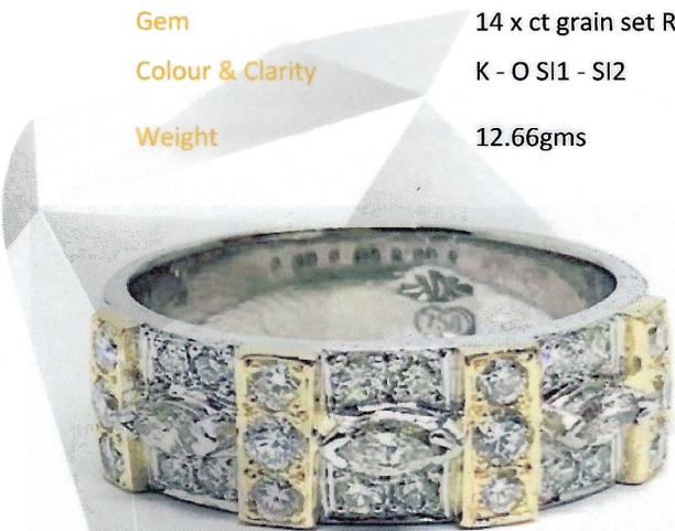
IMAGE NOT ACTUAL SIZE & HAS BEEN ENHANCED FOR VISUAL EFFECTS