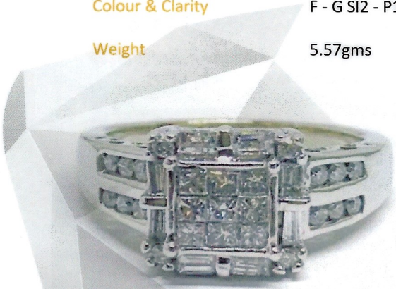
IMAGE NOT ACTUAL SIZE & HAS BEEN ENHANCED FOR VISUAL EFFECTS

Item description 9ct White gold multi Diamond Dress Ring - there are nine Princess cut Diamonds set centre with a step down halo of Baguette & Round brilliant cut diamonds that meet the upswept double row of channel set diamonds on the half round ring. Size L 1/2 Stamped 9KT Metal Purity 9ct White gold Gems 8 half bezel set baguette Diamonds = 0.36ct Estimated Weight Colour & Clarity F - G SI2 - P1 Gem 9 illusion set Princess cut Diamonds = 0.27cts Estimated Weight Colour & Clarity F - G SI2 - P1 Gem 12 channel set & 4 claw set Round brilliant cut Diamonds = 0.22cts Estimated Weight Colour & Clarity F - G SI2 - P1 Weight 5.57gms