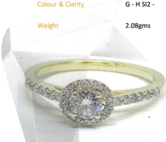
IMAGE NOT ACTUAL SIZE & HAS BEEN ENHANCED FOR VISUAL EFFECTS

This report is limited only for the intended and assigned use, of obtaining consumer insurance. The report is invalid for any other use including, but not limited to, consumer (or) Estate Sale, or Post purchase Authentication (and/or) Price confirmation. Appraisal principles, procedures, methodology and reporting formats are different for those Intended or Assigned uses and the amount might be different. The professional appraisal is based on the limiting parameters as stated. This appraisal has been produced in accordance with the Appraisers International Society.