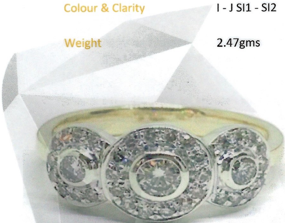
IMAGE NOT ACTUAL SIZE & HAS BEEN ENHANCED FOR VISUAL EFFECTS

This report is limited only for the intended and assigned use, of obtaining consumer insurance. The report is invalid for any other use including, but not limited to, consumer (or) Estate Sale, or Post purchase Authentication (and/or) Price confirmation. Appraisal principles, procedures, methodology and reporting formats are different for those Intended or Assigned uses and the amount might be different. The professional appraisal is based on the limiting parameters as stated. This appraisal has been produced in accordance with the Appraisers International Society.