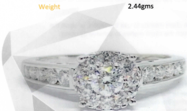
IMAGE NOT ACTUAL SIZE & HAS BEEN ENHANCED FOR VISUAL EFFECTS

This report is limited only for the intended and assigned use, of obtaining consumer insurance. The report is invalid for any other use including, but not limited to, consumer (or) Estate Sale, or Post purchase Authentication (and/or) Price confirmation. Appraisal principles, procedures, methodology and reporting formats are different for those Intended or Assigned uses and the amount might be different. The professional appraisal is a "considered opinion" based on the limiting parameters as stated. This appraisal has been produced in accordance with the Appraisers International Society.