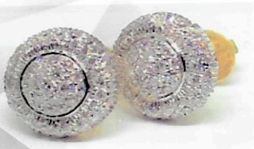
IMAGE NOT ACTUAL SIZE & HAS BEEN ENHANCED FOR VISUAL EFFECTS